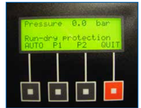
Digital display B-Class

* If the distance between B-Class and rainwater tank is larger than 15 metres, an additional supply pump must be used. (Optional) The controls of the B-Class provide control of the automatic filter cleaners of the Trident rainwater filters.