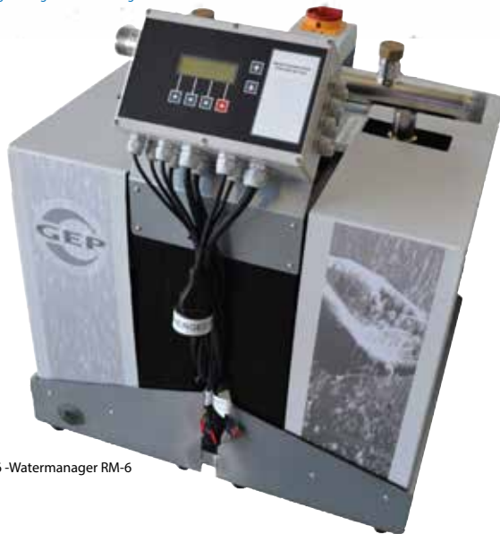
IRM®-6 -Watermanager RM-6