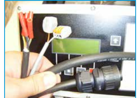
Cabels of the B-Class