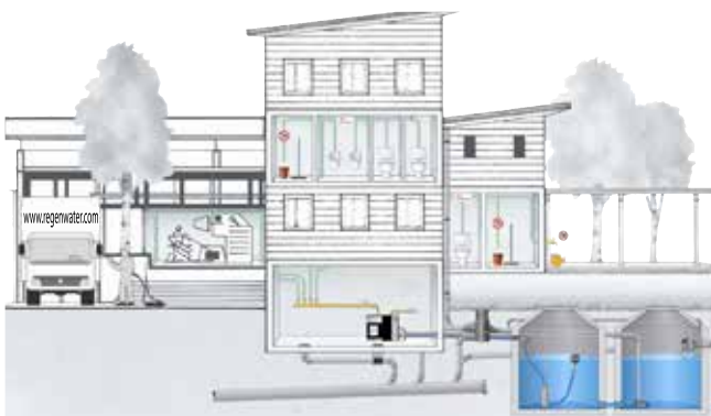
B-Class with supply pump